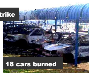
18 cars burned