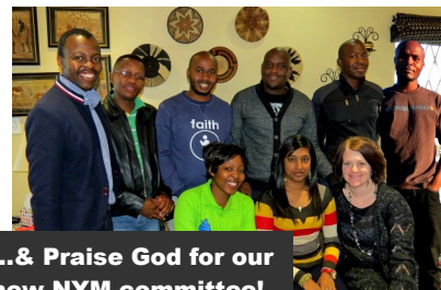
...& Praise God for our new NYM committee!