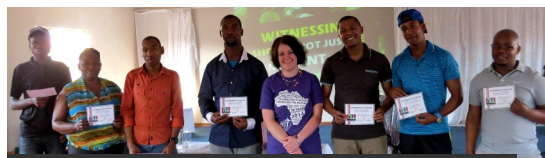
...Trainers of youth leaders were trained